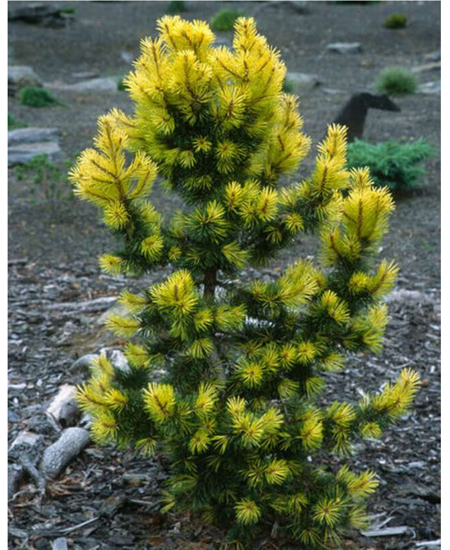
Taylor's Sunburst Lodgepole Pine