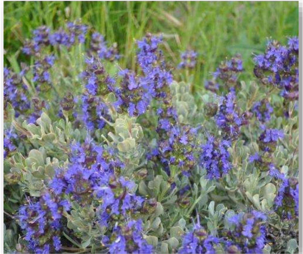
Salvia dorrii v. Clokeyi 'Purple Chip'