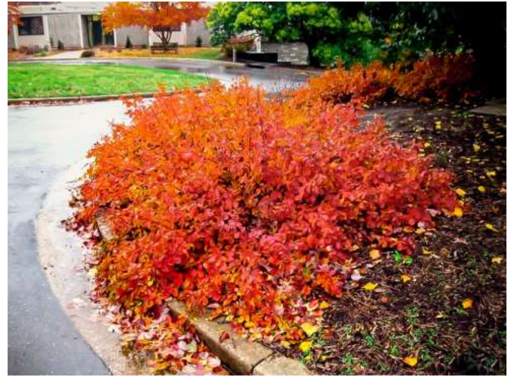
Gro Low Sumac