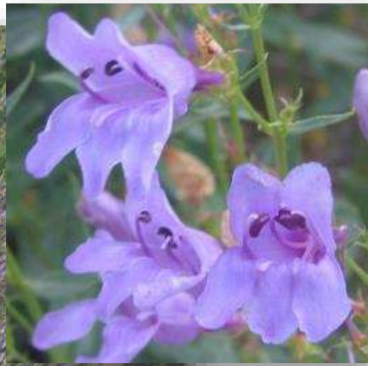
Penstemon platyphyllus 'Uvatung'