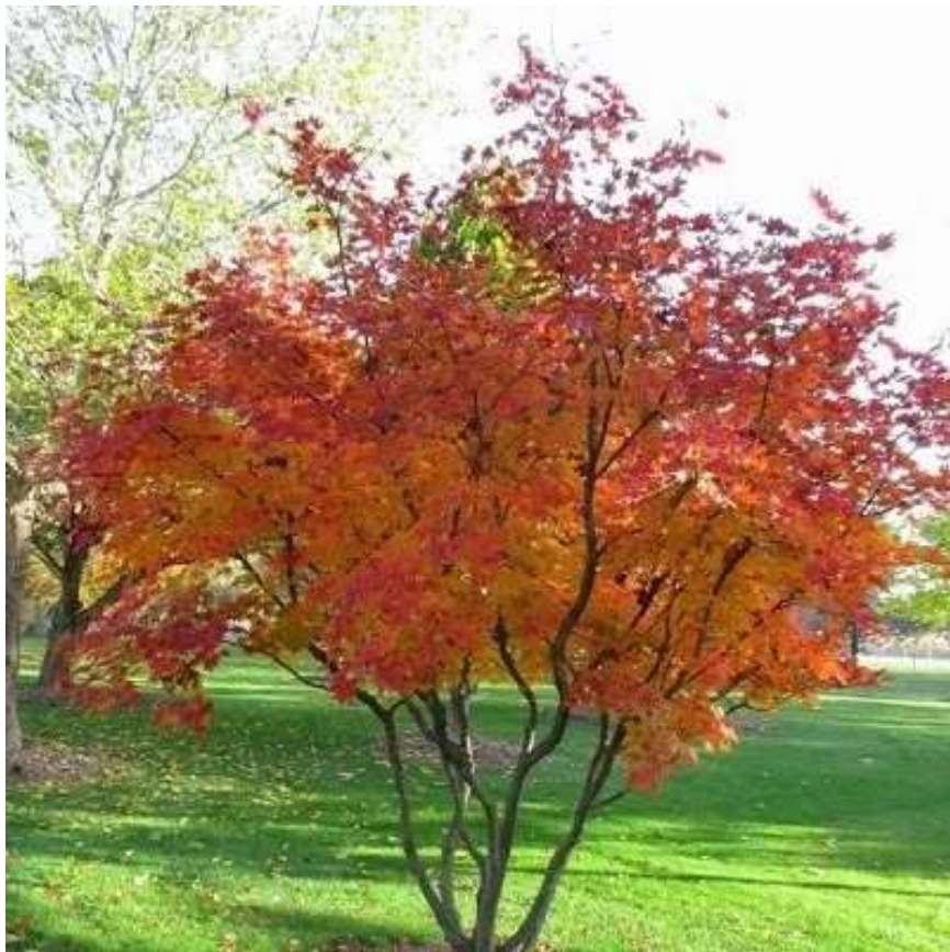
Autumn Brilliance Serviceberry