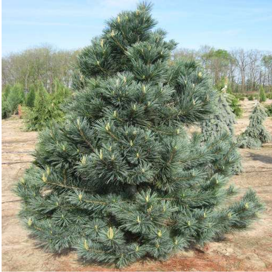
Vanderwolfs Pyramid Limber Pine