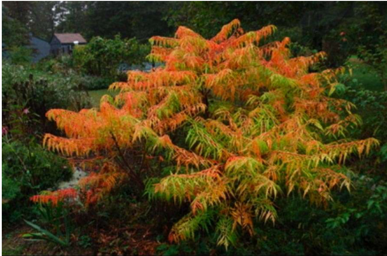
Dragon's Eye Sumac